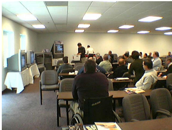
Brown Goods Informational Seminar